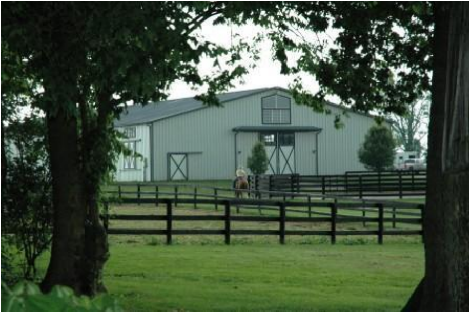
Indoor from the gardens of the Ashley Inn